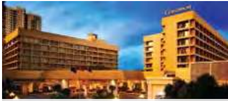
Cinnamon Grand Hotel