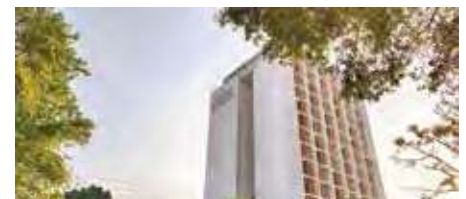
Jetwing Colombo Seven