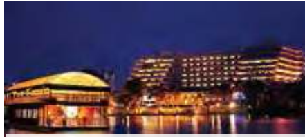
Cinnamon Lakeside Hotel