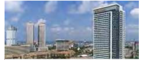
Shangri-La Hotel Colombo