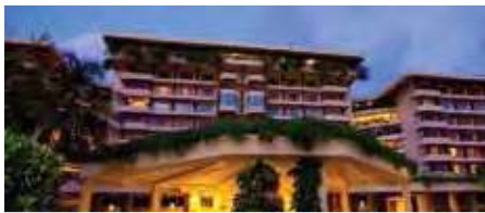
Taj Samudra Colombo